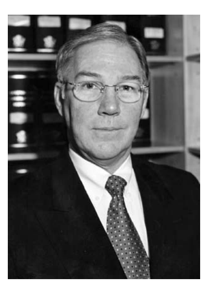
Judge Grant Britton SC