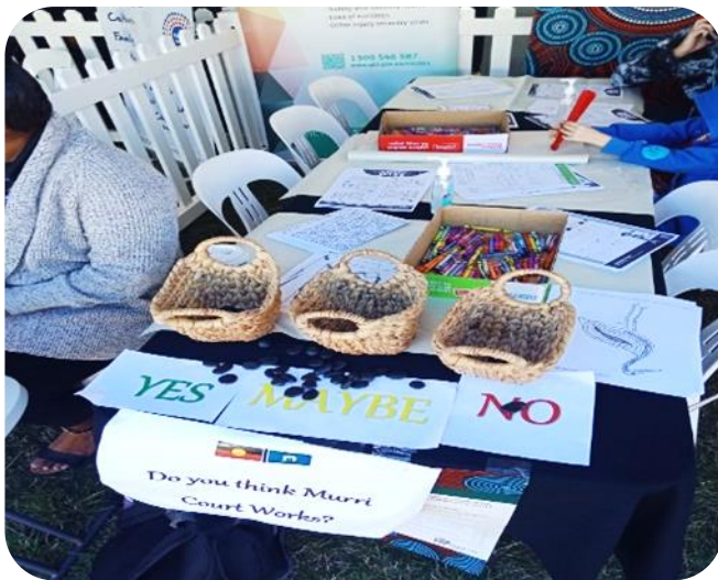
Musgrave Park Family Fun Day with DJAG

The Ipsos ATSIRO team participated in the Musgrave Park NAIDOC celebrations in Brisbane on 13 July 2018 in the Department of Justice and Attorney-General stall and yarned with community about their knowledge of the Murri Court. The community were asked 'do they know about Murri Court' and 'do they think it works'.