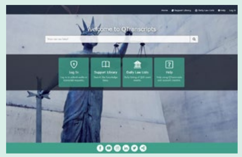
Tip: Ordering audio or transcripts will be quicker if a Digital ID account is created before you access QTranscripts for the first time.