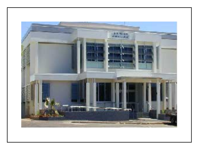
Mt Isa First Supreme Court Sittings 1964 Current Courthouse erected in 1932