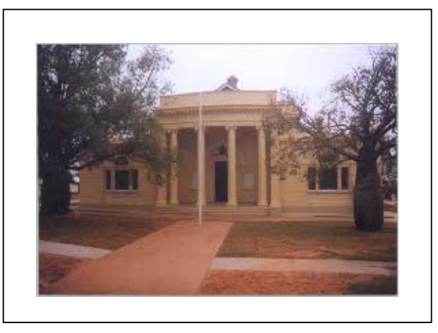
Roma First Supreme Court Sittings 1883 Current Courthouse erected in 1866

The most westerly of the 11 centres in which the Supreme Court of Queensland sits are Mt Isa, Longreach and Roma. It is significant to acknowledge this in the "Year of the Outback".