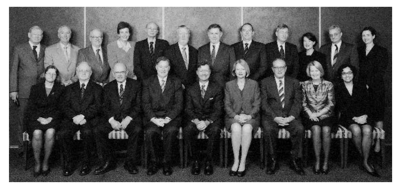
Judges of the Supreme Court