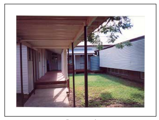
Longreach First Supreme Court Sittings 1922 Current Courthouse erected in 1892