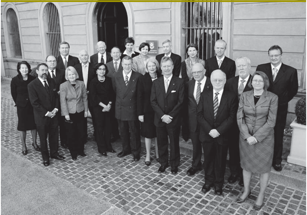
Judges of the Supreme Court