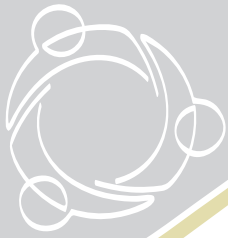
Table 7: Matters heard where one or both parties are unrepresented