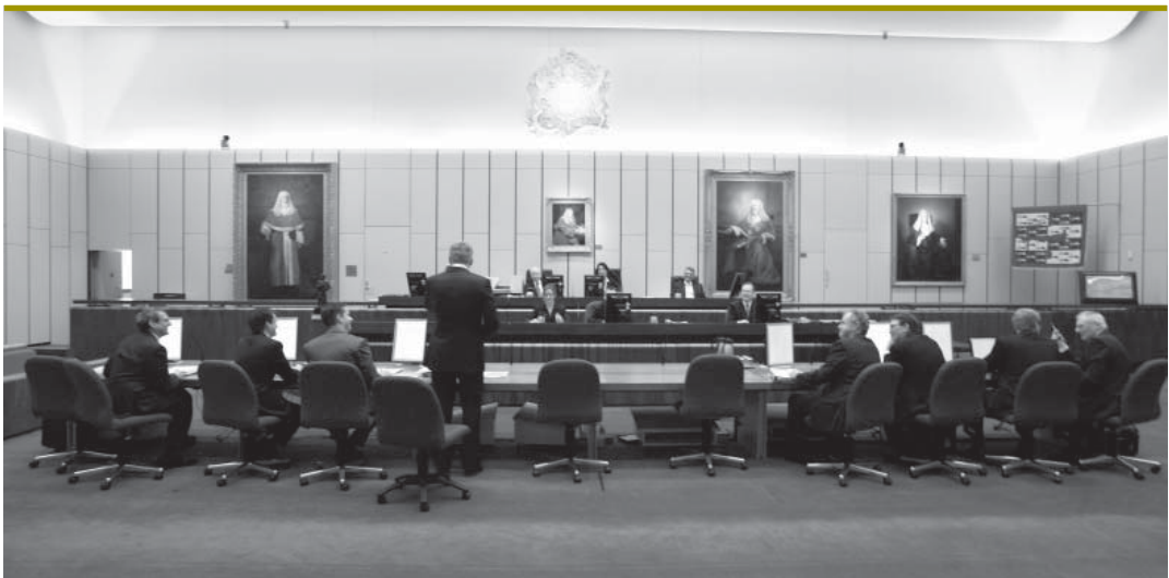
The first electronic appeal was successfully held in the Land Appeal Court in May 2007.

The court technology group in association with the Supreme and District Courts information technology section supplied the technology.