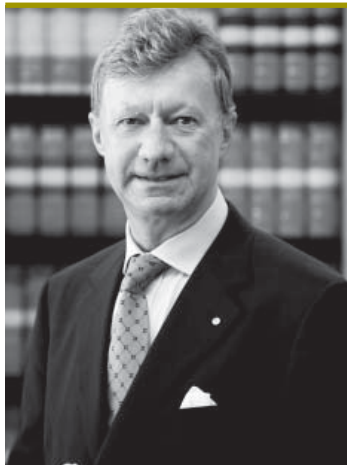
The Honourable Paul de Jersey AC Chief Justice