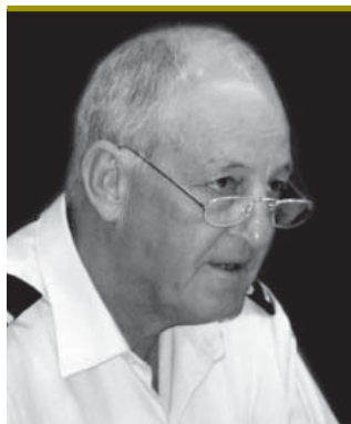
Judge Wall RFD QC at his swearing-in as Deputy Judge Advocate-General, Australian Defence Force