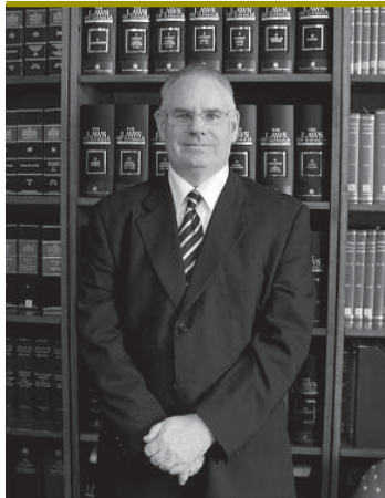
Judge Rafter SC